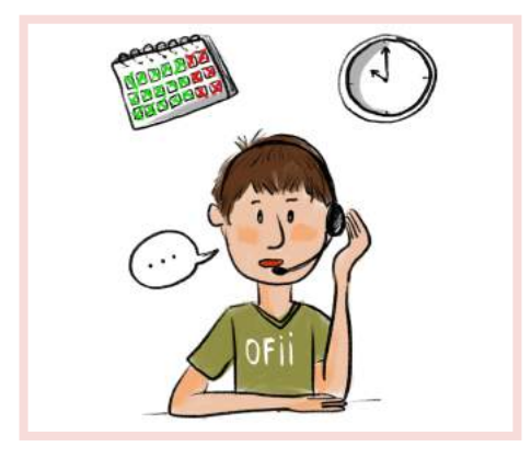
OFII call centres are available for my enquiries from Monday to Friday, from 10 am to 3.30 pm