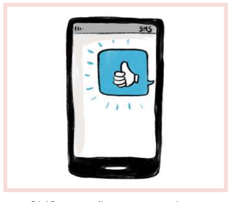
I receive an SMS to confirm my appointment with the admission service (location, date, time). I store it so that I can present it at my appointment